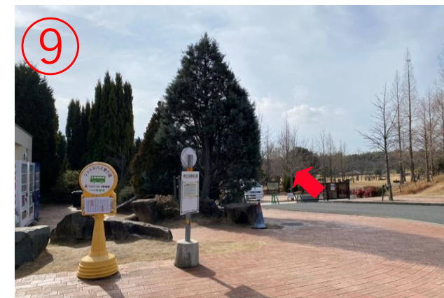
9, The entrance of Nijigen no Mori.