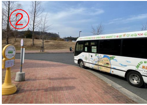
2, Boarding the Free Shuttle bus.