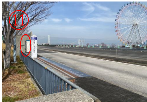
11, Go up the stairs and you can see the "Awaji IC" bus stop.