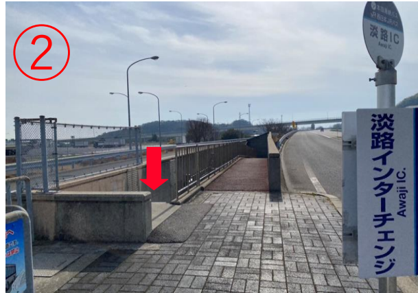
2. You can see the stairs nearby.