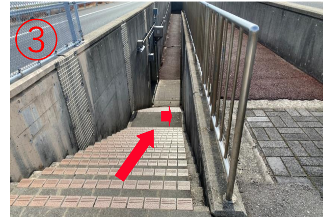
3. Go down the stairs and turn right.