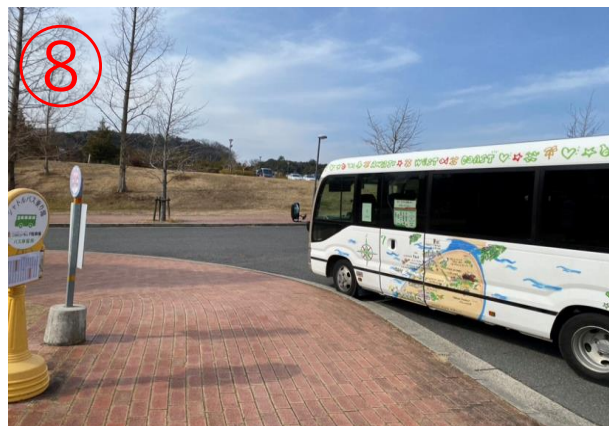
8, Arrive at Nijigen no Mori F parking lot. (the same bus stop on the way back)