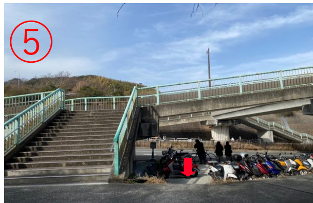
5, Go down the stairs near the tunnel exit and you will find