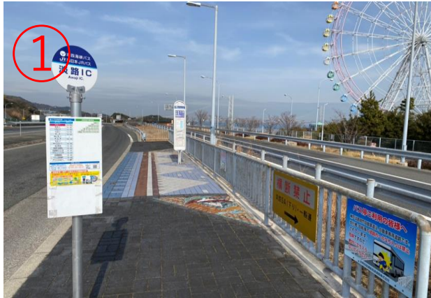
1, Expressway buses from Osaka or Kobe arrive at "Awaji IC" bus stop.