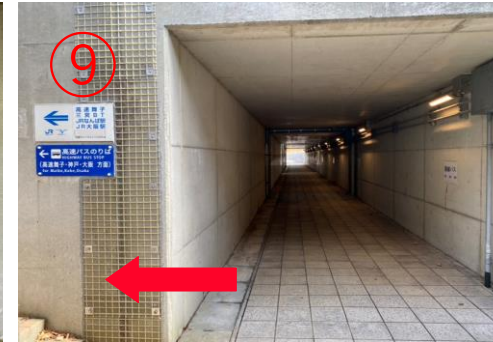
9, If you go a little further, you can see the stairs on both the left and right sides.