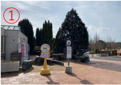
1, Free shuttle bus stop at Nijigen no Mori F parking lot.