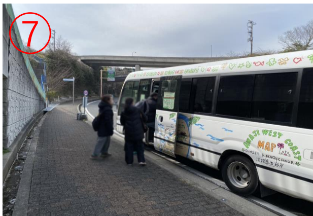
7, Boarding the Free Shuttle bus