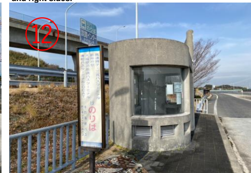
12, Arrive at "Awaji IC" bus stop.