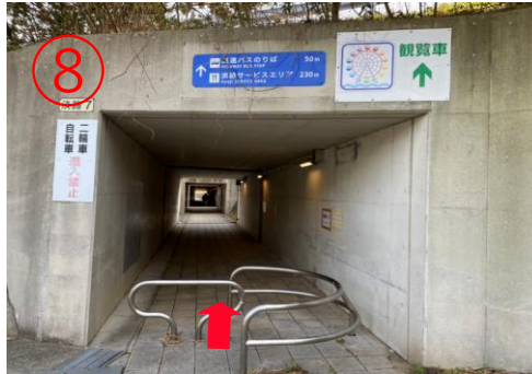
8, Enter the tunnel.