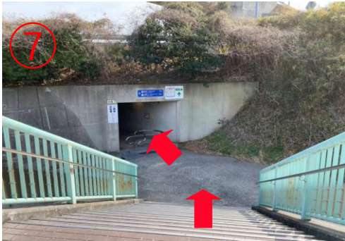
7, When you get off the bridge, you can see the tunnel.