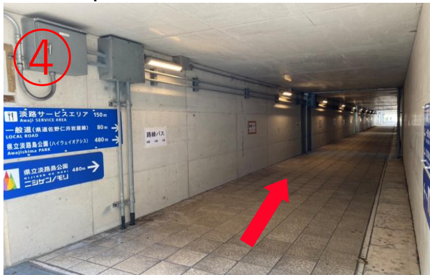
4, Go straight.