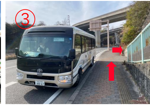
3, Arrive at Awaji IC. *The expressway bus stop is on the other side of the road.