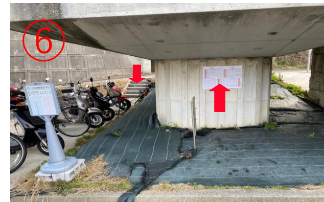
6. There is a free shuttle bus timetable on the wall of the bridge.