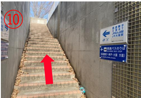
10, Go up the stairs on the left.