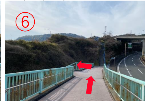
6, Get off the bridge from the stairs on the left.