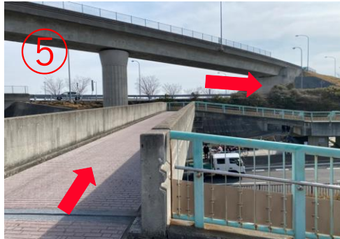
5, Go straight.